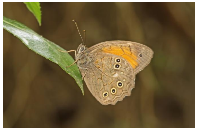
From top: Nickerl's Fritillary, White Pelicans & Lattice Brown.